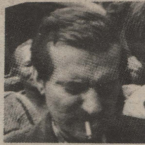
Lech Walesa... strike leader.

Spokesmen for the workers said the new union would not replace the existing state-controlled trade union council, but would operate independently.